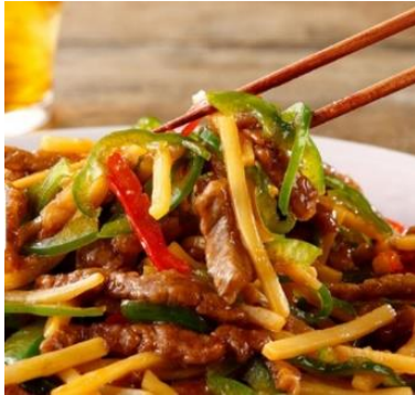
[Meal kit] Meat-Yummy! Crunchy colorful vegetables and beef Chinjaorosu, 2 servings (chilled) 2 servings (¥590 yen /serving) 1,180 yen(1,275 yen with tax)

We offer convenient sets of ingredients required for each menu. Lots of ingredients are can be used quickly on busy days, and meal kits linked with recipes and ingredients are convenient and time saving. We conduct in-house tasting sessions to confirm taste before commercialization. We also have a selection of products that focus on freshness of meat cut the very day of delivery bundled with vegetables to go along.