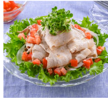
[Frozen] Asahi Meat Cooperative Society Chiba potato pork, choppedthin slice 300g 1,014 yen(1,096 yen with tax)