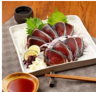
[Frozen] 100% processed in Kochi Japanese Straw-grilled bonito 1 strip300g 1,780 yen(with tax1,923 yen)