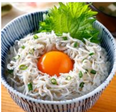
[Frozen] Mori Marine Productsfrom Ehime Kama-age princess shirasu (whitebait) 25g×x10 1,480 yen(with tax1,599 yen)

We also offer a wide variety of frozen foods that can be easily prepared when you want to save time. It will add color to your table when you want one more dish for dinner. It is one of the items you should always have on hand, as it can be included in bento menus. It is also a great way to save cooking time, making it an ideal meal for busy days. We plan to offer the industry's largest selection of approximately 2,000 items, including sashimi made from fresh, seasonal fish frozen in its entirety.