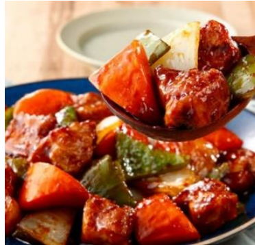
[Meal kit] Meat yummy !Japanese pork shoulder and domestic vegetable with black vinegarSubuta sweet-and-sour pork For 2 servings(Chilled) For 2 servings(499 yen/serving) 998 yen(with tax1,078 yen)