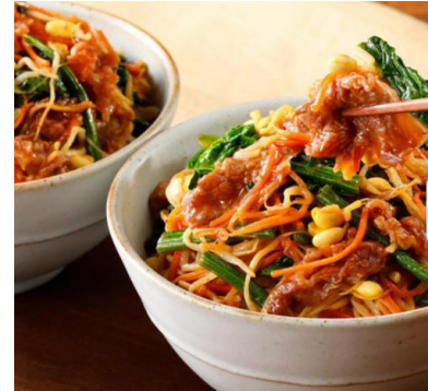
[Meal kit] Meat yummy !Full of tasty vegetables Bibimbap rice bowl ingredients 2 servings (Chilled) 2 servings(499 yen /serving) 998 yen(1,078 yen with tax)