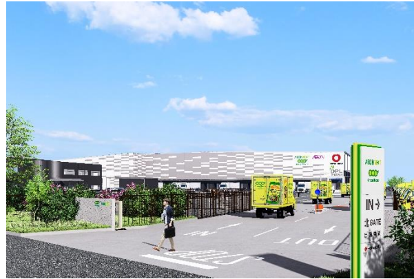
left: aerial perspective drawing right: perspective drawing of the front entrance